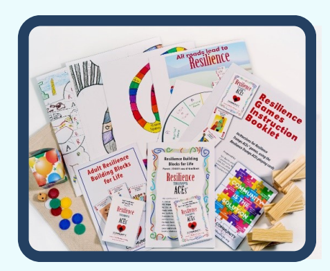
Building Community Resiliency tools

The More Resilient Minnesota Lending Library has been developed to give Collaborative Coordinators an opportunity to borrow resources that help expand their knowledge and understanding of NEAR (Neurobiology, Epigenetics, ACEs, and Resilience) Science, and support their local community resiliency planning efforts.